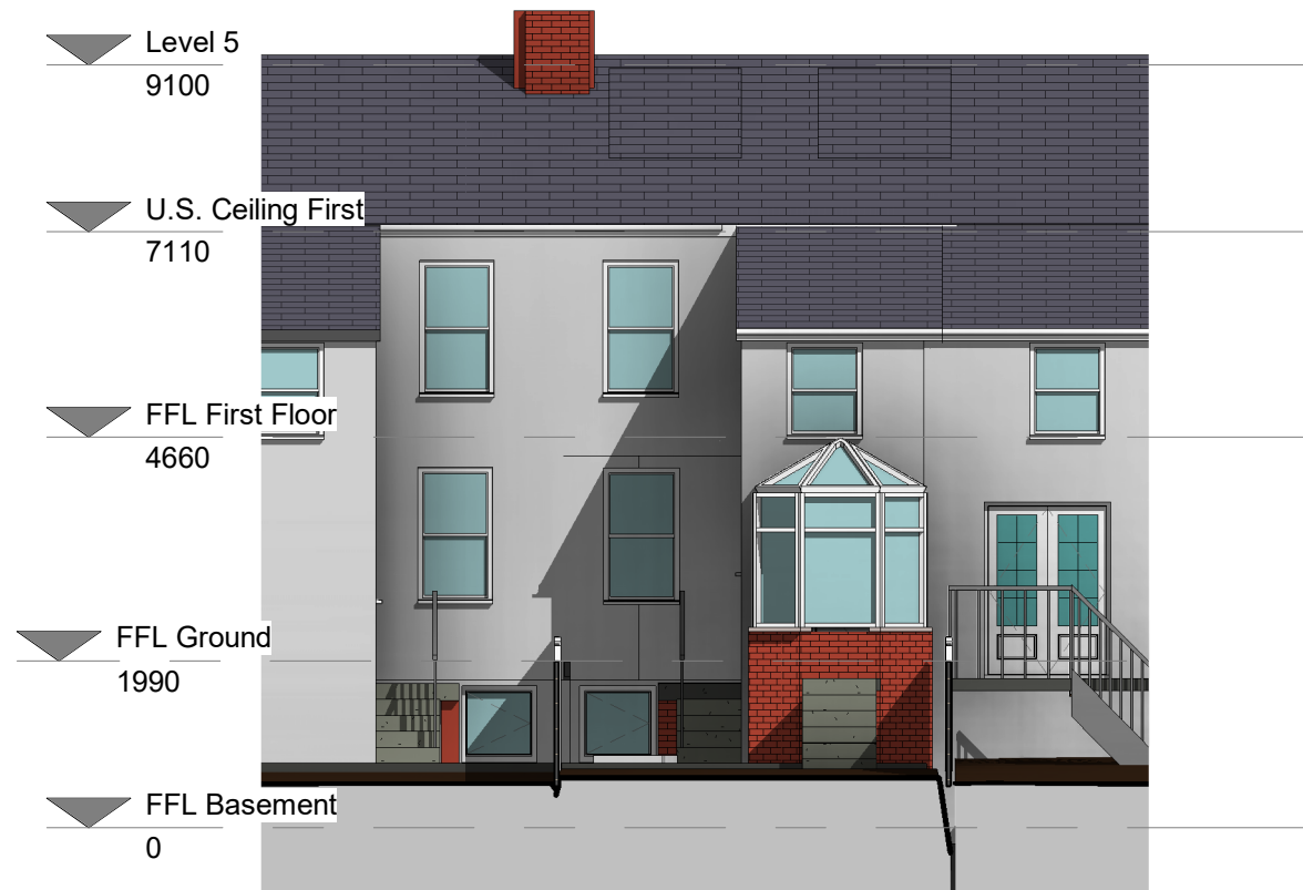
1 South Existing Spring 1 : 100