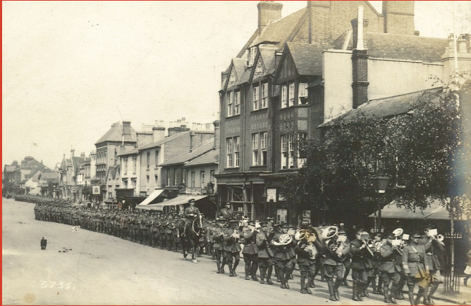
Along the High Street, the Town Hall in the distance