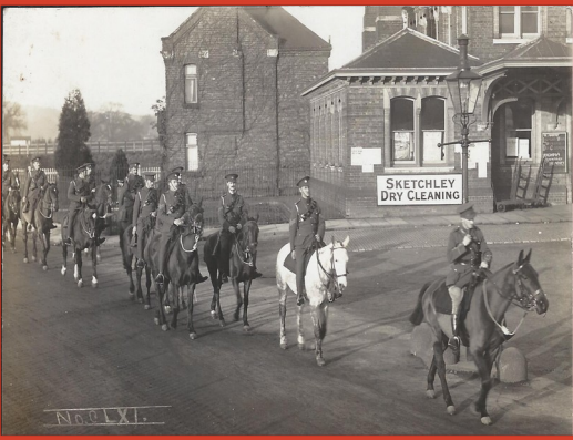
Regimental Band outside Court House