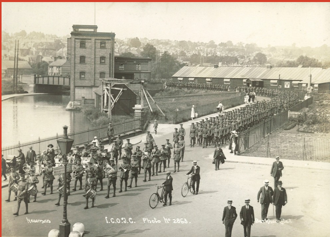
Lower Kings Road with YMCA Hut, top right

Download Audio Commentary www.berkhamstedtowncouncil.gov.uk/town-guide